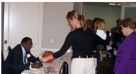
Meeting the "Clown Prince of Basketball".

in the lives of one another is a joy. Whether standing at the mid-court line on the basketball court or standing behind a microphone, Meadowlark Lemon shared with his spectators the meaning of the assist, the value of team participation and what it truly means to help.