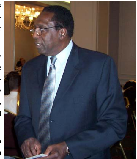
Meadowlark Lemon challenges spectators to help.

We were delighted and privileged to welcome retired Harlem Globetrotter, Meadowlark Lemon. This well-known "Clown Prince of Basketball", also known for his near perfect hook shot from half court, challenged and entertained his audience. He spoke of the special needs of children and of how all of us, young or old, man or woman, at one time or another need help. He stated that the opportunity to make a difference